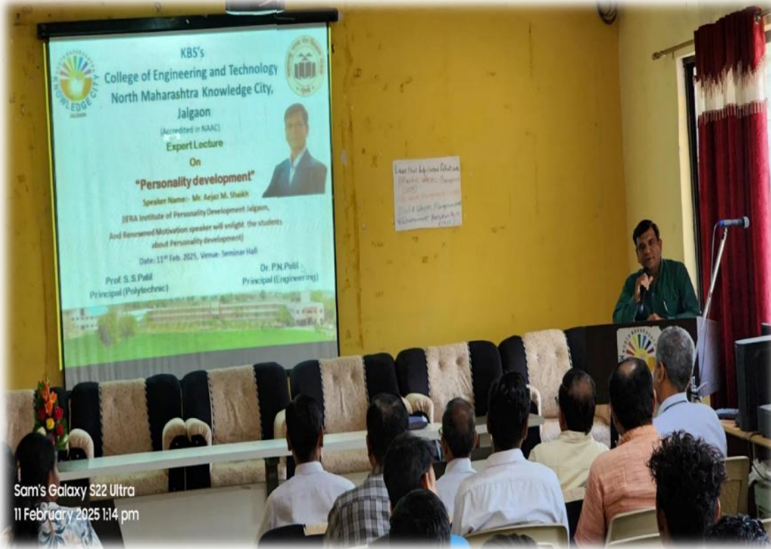
Sam's Galaxy S22 Ultra 11 February 2025 1:14 pm