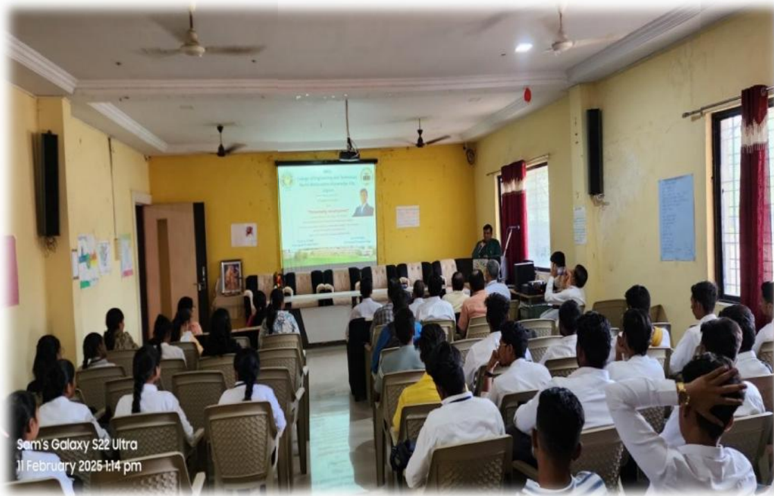
Sam's Galaxy S22 Ultra 11 February 2025 1:14 pm